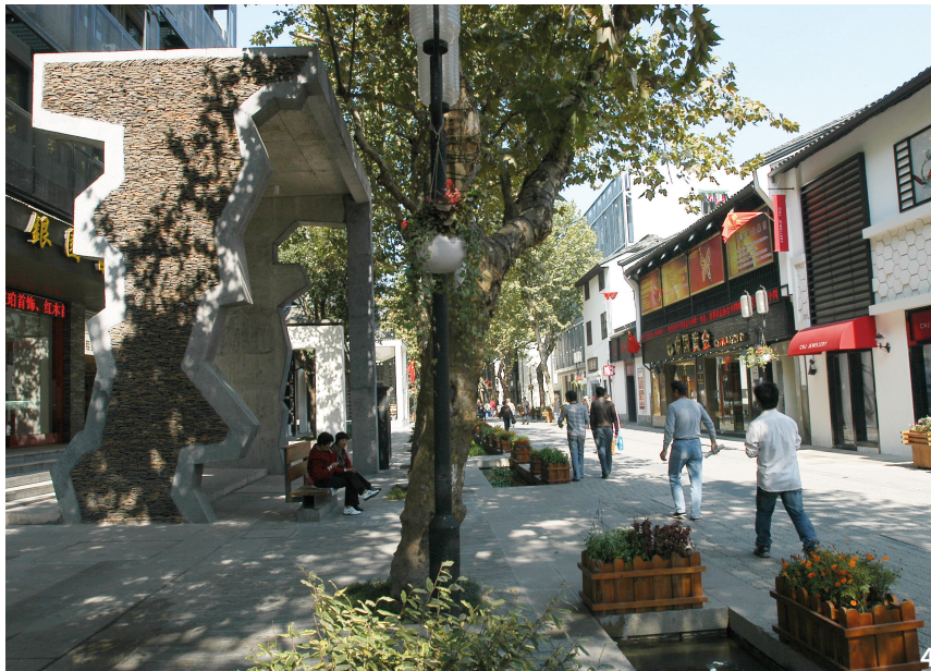
Figure 4 Small buildings along the street after completion.