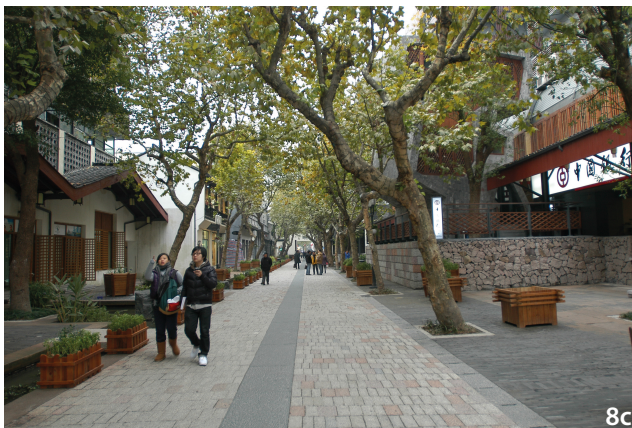
Figure 6 Mixture of the old and the new buildings (Source: the author). Figure 7 North entrance of the pedestrian street (Source: the author). Figure 8a A portion of Zhongshan Road before the renewal project (Source: the author). Figure 8b The design sketch for Zhongshan Road renewal project (Source: the author). Figure 8c Zhongshan Road after the completion of project (Source: the author).

was partial. It brought huge difficulties to the renovation project and therefore the project team had to conduct the mapping and survey from scratch. As a consequence of avoiding forced relocation, some local residents were willing to move, while others insisted to stay. Therefore, the construction schedule had to be modified for several times according to the relocation process. Should the local government promote future initiatives with high quality standards, it will probably face a similar situation. In this case, we hope that the Zhongshan Road project will be considered a useful test site. (Figure 8).