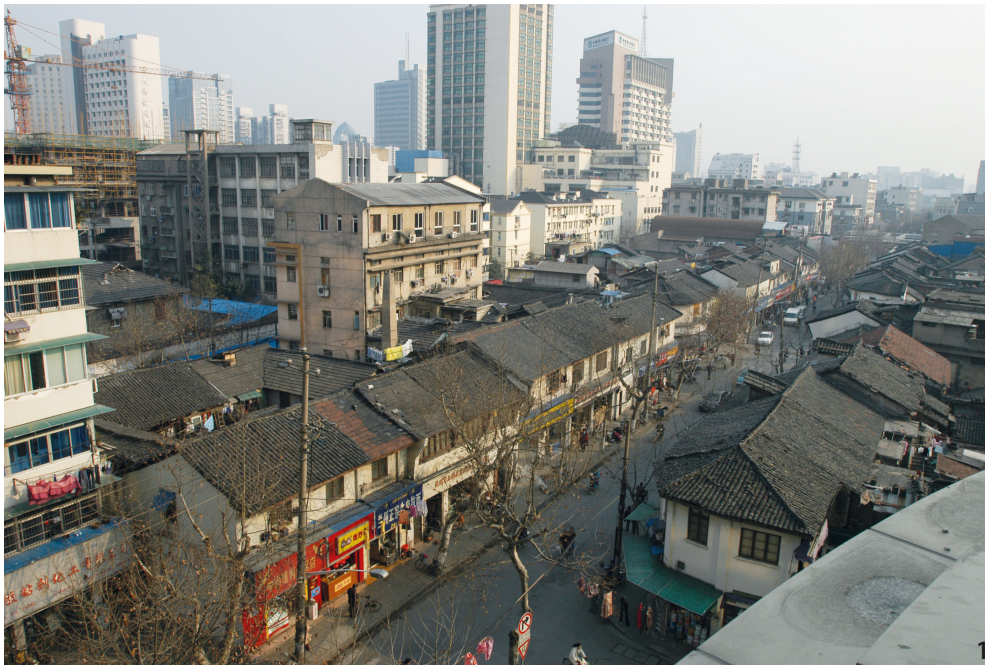
Figure 1 Zhongshan Road before the renovation project.

historic styles, the other ones would be damaged. Therefore, how to deal with this complex and mixed historic urban fabric has become the core issue in this project.