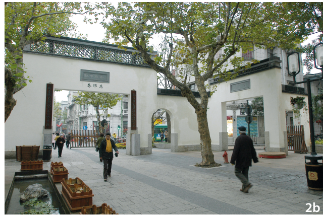
Figure 2 Intervention on the block wall and the street.

decades comply with the new setback building regulations, while those old houses still situated along the street lack any setback. Therefore, Zhongshan Road was partially widened, while other parts were still relatively narrow. We decided that a row of two-storey new buildings would be added alongside the widened parts to keep the walkable 12-metre road width. This proposal of narrowing a road instead of widening it is unprecedented in the modern history of Chinese cities.