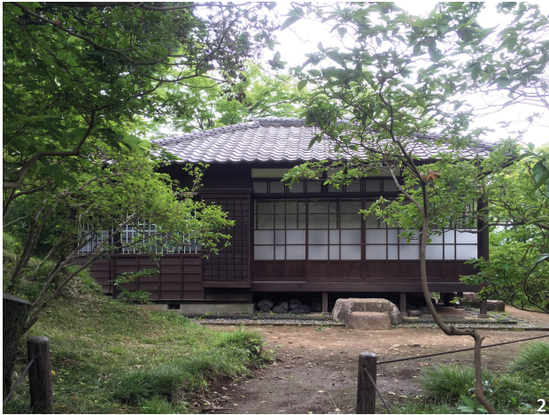
Figure 2 Taut's home—Senshintei—in Takasaki.

translated architectural elements of a foreign culture in the 1930s. As art historian Michael Sullivan put it, we 'have come to a point in ... the East-West confrontation where it is legitimate to ask ... what the significance of this interaction is for the future of art.' (Sullivan 1989, 271) Moreover, from the point of view of built heritage, this villa is a unique case where the fragility of materials and the novelty of detailing require a mix of Western and Eastern conservation attitudes: an emphasis on both physical integrity and immaterial authenticity (Ceccarelli 2017).