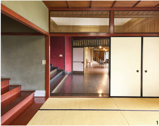
Figure 1 Hyuga Villa (Source: Dave Clough).

Atami, just before his departure for Turkey, provided an attempt to express elements of Western design into Japanese domesticity (Figure 1).