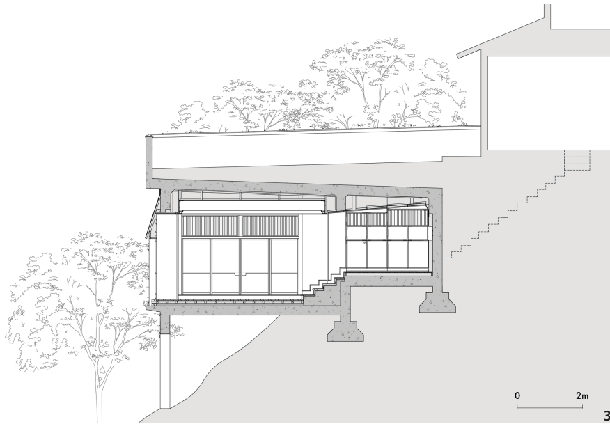
Figure 3 Cross-section of Hyuga Villa, showing the spatial relationship between the upper and lower structures.