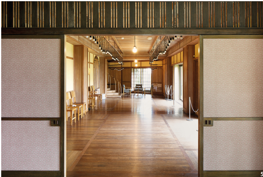
Figure 5 Ping-pong room as seen from the western-style living room.

a direct adoption of the technique seen in Katsura Villa, migrated from an exterior to an interior space. Along these lines, Taut documented the particular way in which the underside of Kyoto's villa is sometimes concealed by a series of bamboo poles (1b), forming a grate blocking access and view, but allowing the necessary airflow (Taut 1937, 282–283). In addition to adapting an outdoor architectural detailing to an indoor space, Taut asked the carpenters to seamlessly place fine bamboo twigs as a wall covering, a difficult and unusual task. A third case of translation in the ping-pong room is represented by the hanging light bulbs. They are arranged in wavy fashion (3a), joined to a bamboo pole by a reed chain made of bamboo links ( tsuru ). Just before his departure for Istanbul Taut sketched a watercolor (3b) where he described these light bulbs with the following comment: 'Wer da baut an der Strasse, muss die Leute reden lassen' (He who builds along the street, should let people talk). While it might only be a speculation, the wavy alignment of hanging paper lanterns, to the right and left side of streets leading to a shrine during local festivals in Japan, reveals perhaps the visual source of Taut's design (Figure 5). In this solution Manfred Speidel sees instead a reference to a 1915 design for a wrought iron piece by Taut for the Berlin Secession (Speidel 1994, 279).