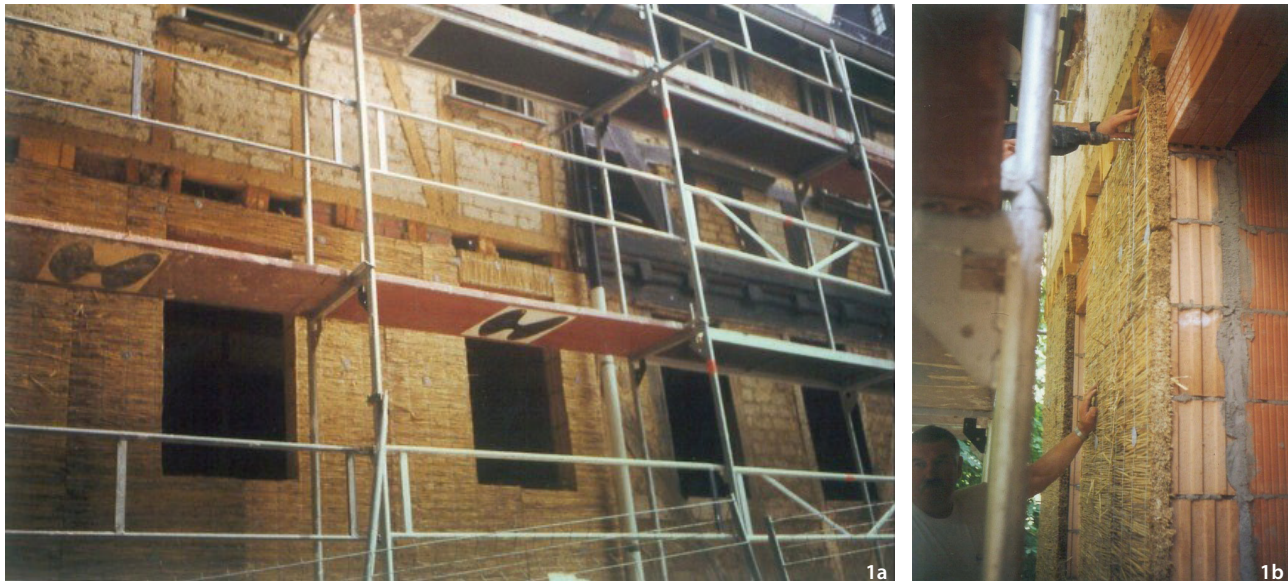
Figure 1 Reed insulation was installed during the restoration of the 'Lottehaus' in Wetzlar, Germany (Source: the author).

management. When conserving and preserving historic buildings—in addition to quality and aesthetics—the type of plaster employed is an important consideration. Making such an assessment requires specialist knowledge. Maintaining old buildings demands sophisticated conservation measures. To meet client requirements for appropriate, long-term conservation necessitates close cooperation among assessors, planners, contractors, and material suppliers.