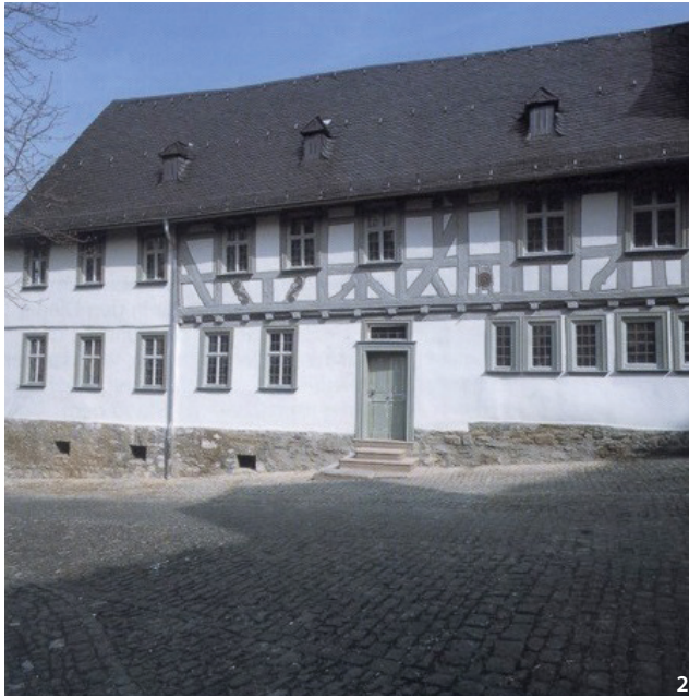
Figure 2 20 years after restoration, the Lottehaus in Wetzlar received the Hessian Monument Protection Award.