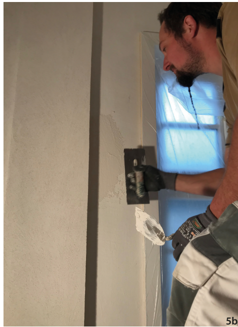
Figure 5 Ongoing restoration work with modernised lime insulation plaster in 2018 accompanied by inspections and planned to be monitored by experts (Source: the author).