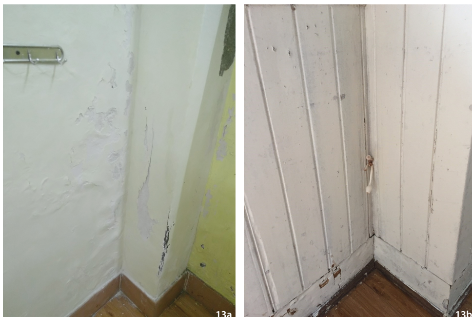
Figure 13 Defects in one kindergarten in Hangzhou, which may cause severe health risks, need a special solution (Source: the author).

Long-term monitoring with the German case studies demonstrated that sometimes the only solution for quality conservation of a structure may be to change its appearance. That could amount to modifying a façade from an un-rendered to a rendered surface or vice versa.