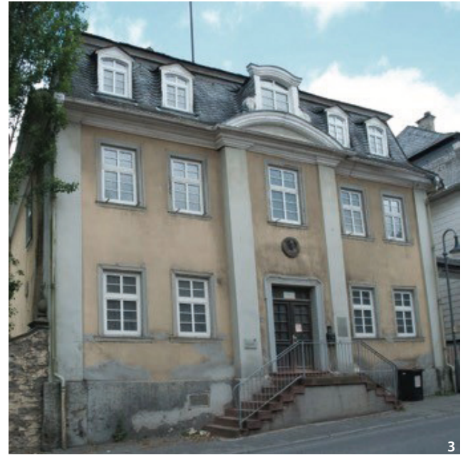
Figure 3 Usingen fürstliches Beamtenhaus before restoration.

The thickness of the reed insulation panels was in the range of 2–5 cm (Figure 1). Insulation lime mortar, with a grain size of 4 mm, was applied over large areas of the reed insulation panels. Subsequently, a top coat of lime mortar, with a grain size of 2 mm, was applied. When the Lottehaus was originally constructed, the half-timbering on the upper floor was visible, but that became plastered over in 1750.