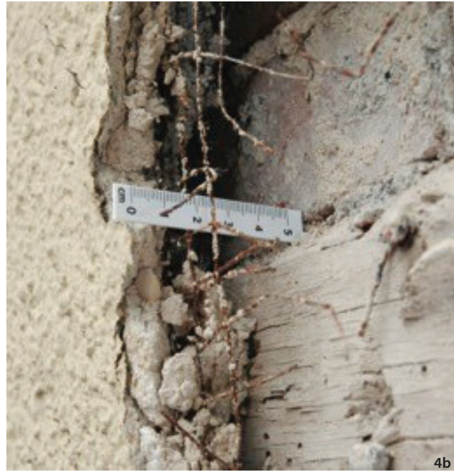
Figure 4 Cement plaster applied in the 1950's.

The fürstliches Beamtenhaus has two floors. It was built using a plaster framework, and it has a three- to five-axis structure on its main façade (street side). The façade is enclosed by pilasters with a central risalit. The strong design of the building is emphasised by its main axis with a central risalit, a two-flight staircase, and an entrance portal with a Baroque profile.