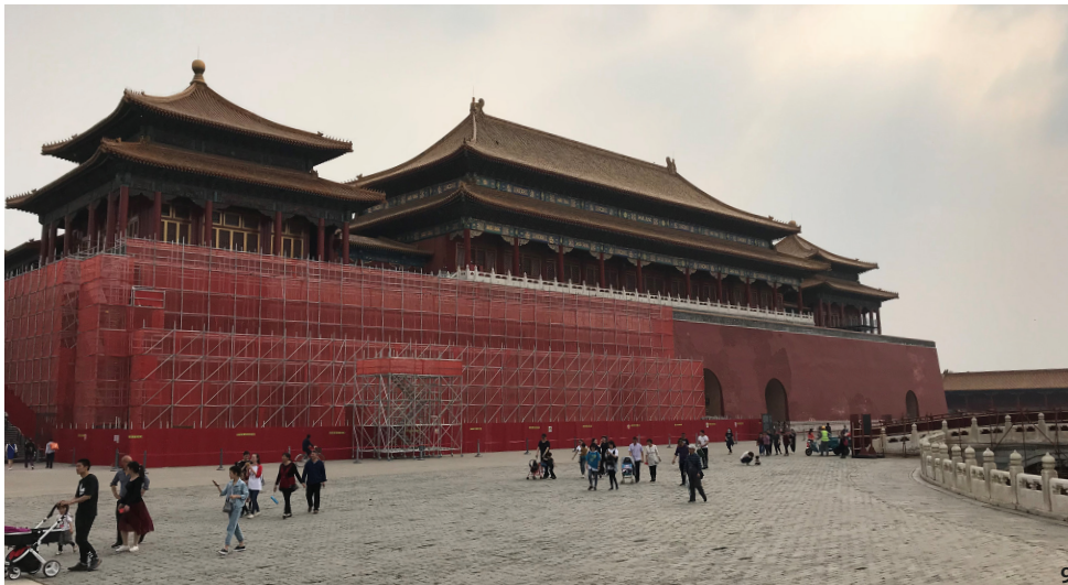
Figure 9 Lime plaster maintenance for Wu Men (Meridian Gate) of the Palace Museum in Beijing during the summer 2018 (Source: the author).

constructed in brickwork, which were plastered; occasionally the plaster imitated a bossing stone structure to lend an appearance of grandeur.