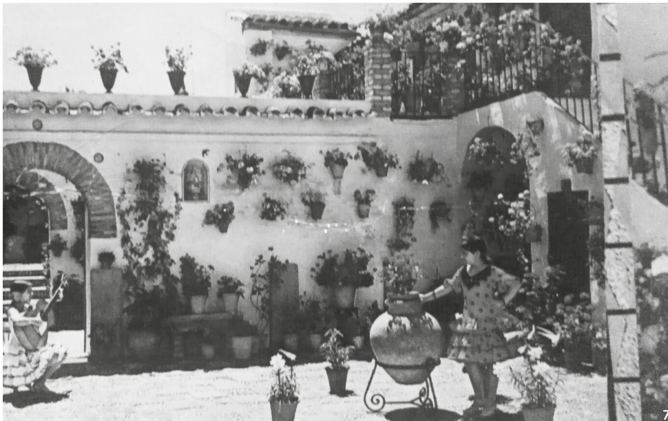
Figure 7 First PAX Cooperative. An historical photo when it was full of life and families living.