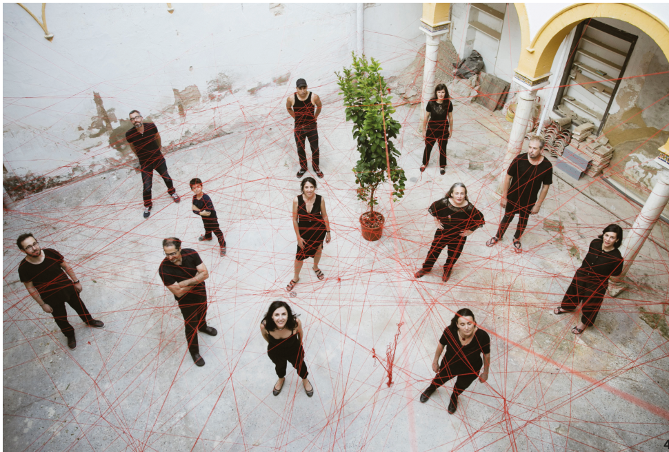
Figure 4 The PAX Team members during the installation done for the 15 th International Exhibition of Architecture. La Biennale of Venice (Source: Sergio Flores).

Recognised as part of the Faro Convention Network by the Council of Europe in 2018 for applying social heritage values in an urban context, PAX was invited to the 15 th International Architecture Exhibition La Biennale in Venice in 2016 (Figure 4) and has been declared a 'best practice' project by the Madrid City Council for improving the social economy in a neighbourhood (2018) and has been the subject of an article published in the internationally Italian magazine Abitare (Franzoia 2016).