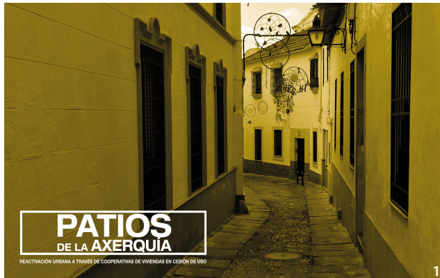
Figure 1 A typical street of Axerquia and PAX logo.