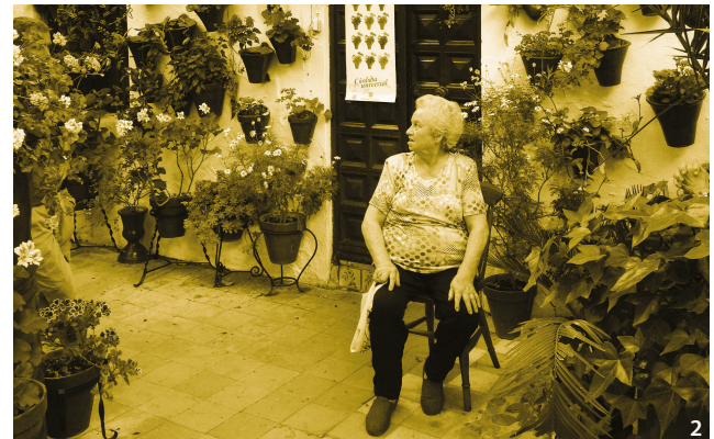
Figure 2 A typical patio house of the Axerquia with an old woman living alone (Source: Carlos Anaya).

rather, touristification. Perhaps it can be said that unfortunately, Spain has moved from a real estate bubble to a tourism bubble.