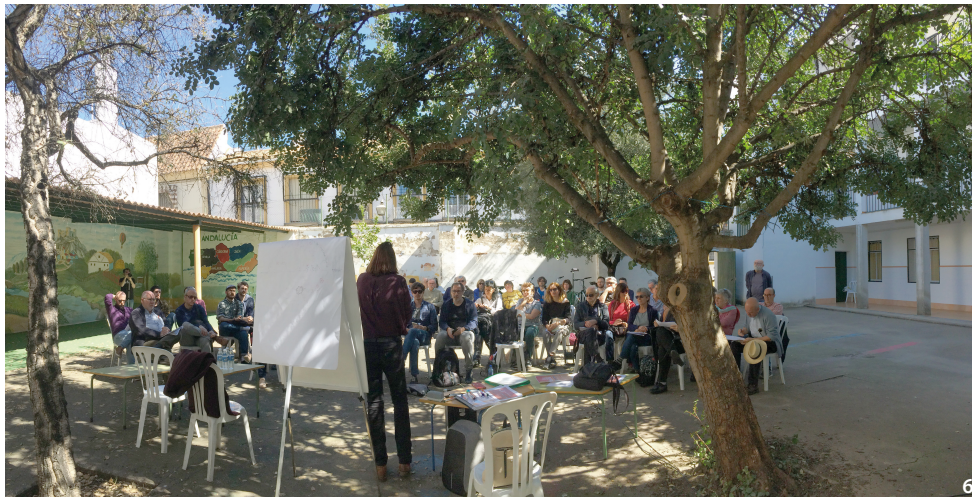
Figure 6 Meeting of the 'Right to the City' Forum in a courtyard of a public building on March 2019 (Source: the author).