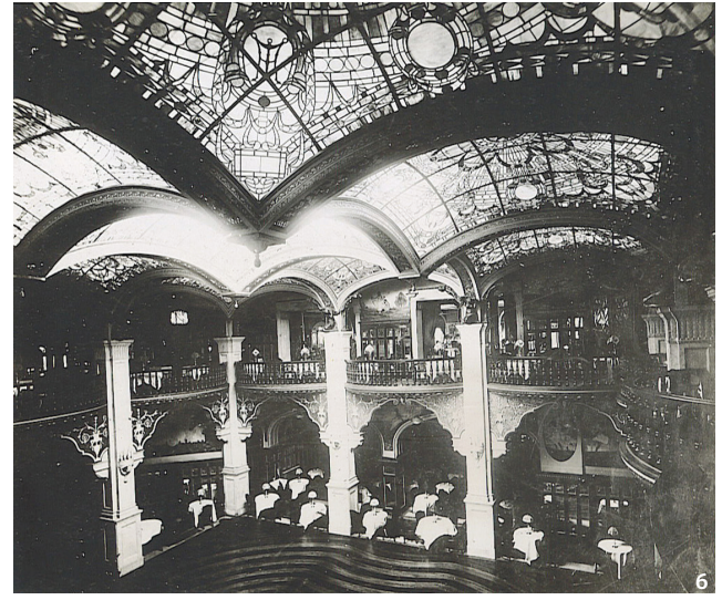
Figure 5, Figure 6 Views of the Astor House Hotel ballroom, photo taken in 1923 (Source: Abelardo Lafuente's Personal Portfolio from Lafuente Family Private Archive, cited in Leonardo Pérez 2019).