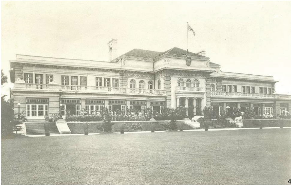
Figure 4 View of the Shanghai Jewish Club and Mr. Kadoorie's mansion (Source: The Hong Kong Heritage Project, 2011).