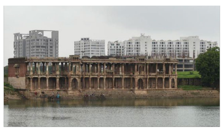
Fig. 2 Sarkhej Roza Complex, Ahmedabad

Westernised conservation planning cannot be implemented within the context of multiple cultures since external factors cannot be the mere determinant of character. Figure 1 shows the Taj Palace Hotel and Gateway of India in Mumbai, which are distinctive monumental buildings of character that are well conserved. Figures 2 and 3 provide a glimpse of the rapid urbanisation occurring within and near the sites of historic value where the character of the buildings is insensitively lost among modern constructions.