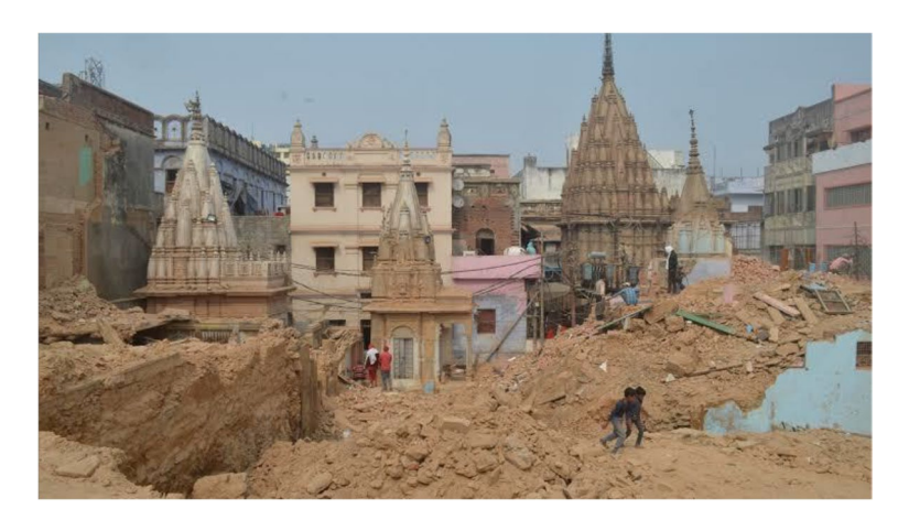
Fig. 3 Demolition work for the Kashi Viswanath Temple Corridor, Varanasi

executive framework (techniques formulated while executing the project). The conservation frameworks of various developed and developing countries were compared through a literature review to identify factors that influence the outcome of a conservation project. Chen formulated six aspects for assessing urban heritage conservation performance, consolidated from a series of works performed by Kocaban, Steinberg, Cohen, Su, and Orbasli (Chen, Yoo, and Hwang 2017). The six aspects are the physical, social, economic, cultural, political, and continuity aspects.