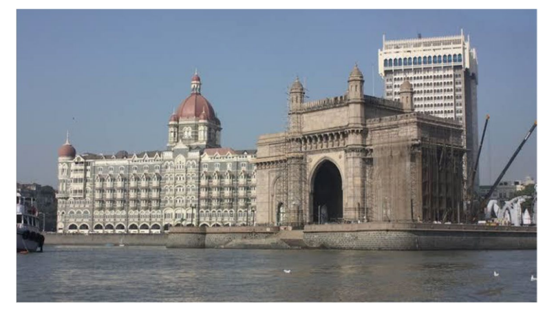
Fig. 1 Taj Palace Hotel and Gateway of India, Mumbai